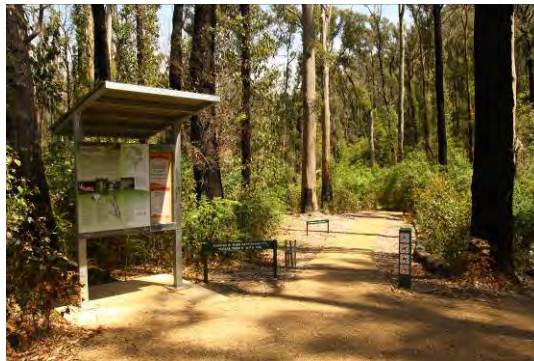
Island Creek Picnic Area

Each species has its own survival features - grass trees send up their tall flowering spikes full of seed and tree ferns are protected by thick bark. Acacias may survive due to regrowth from root suckers and soil stored seed. Gradually other species have regerminated in the park including Bush peas, Cassinias, Heath, Tussock grass and orchids.