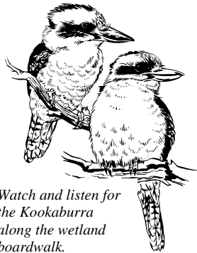
Watch and listen for the Kookaburra along the wetland boardwalk.

"A stroll among the gigantic ferns of the valley ... a ramble among the cones and craters ... the winding path at the foot of the basaltic rises close to the lake ... almost tropical reeds rustle in the breeze ... leafy shrubs and trees form delightful bowers and alcoves ... tender emotion in suitable company". Notes from George Bonwick's visit to Tower Hill in 1858